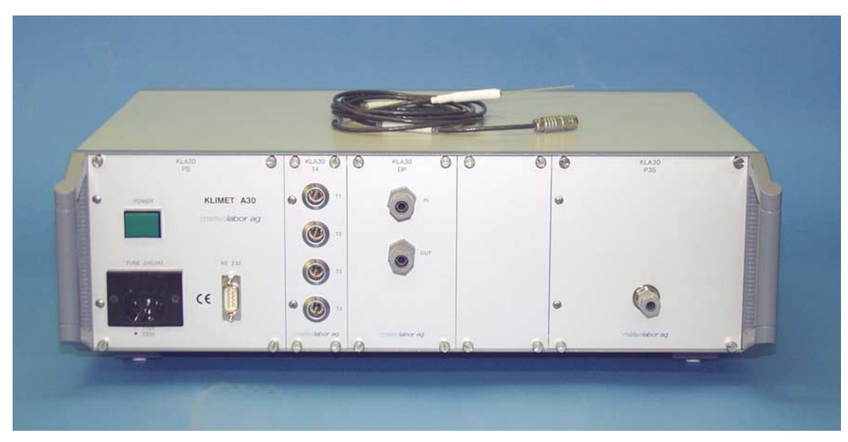
Precision climate measurement instrument Klimet A30

The precision climate measurement instrument is used for accurate measurement of the air temperature, humidity and barometric pressure.